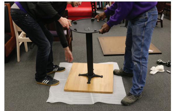
Table is fully assembled.