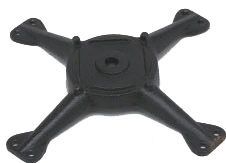
SS-13J 13" Cross