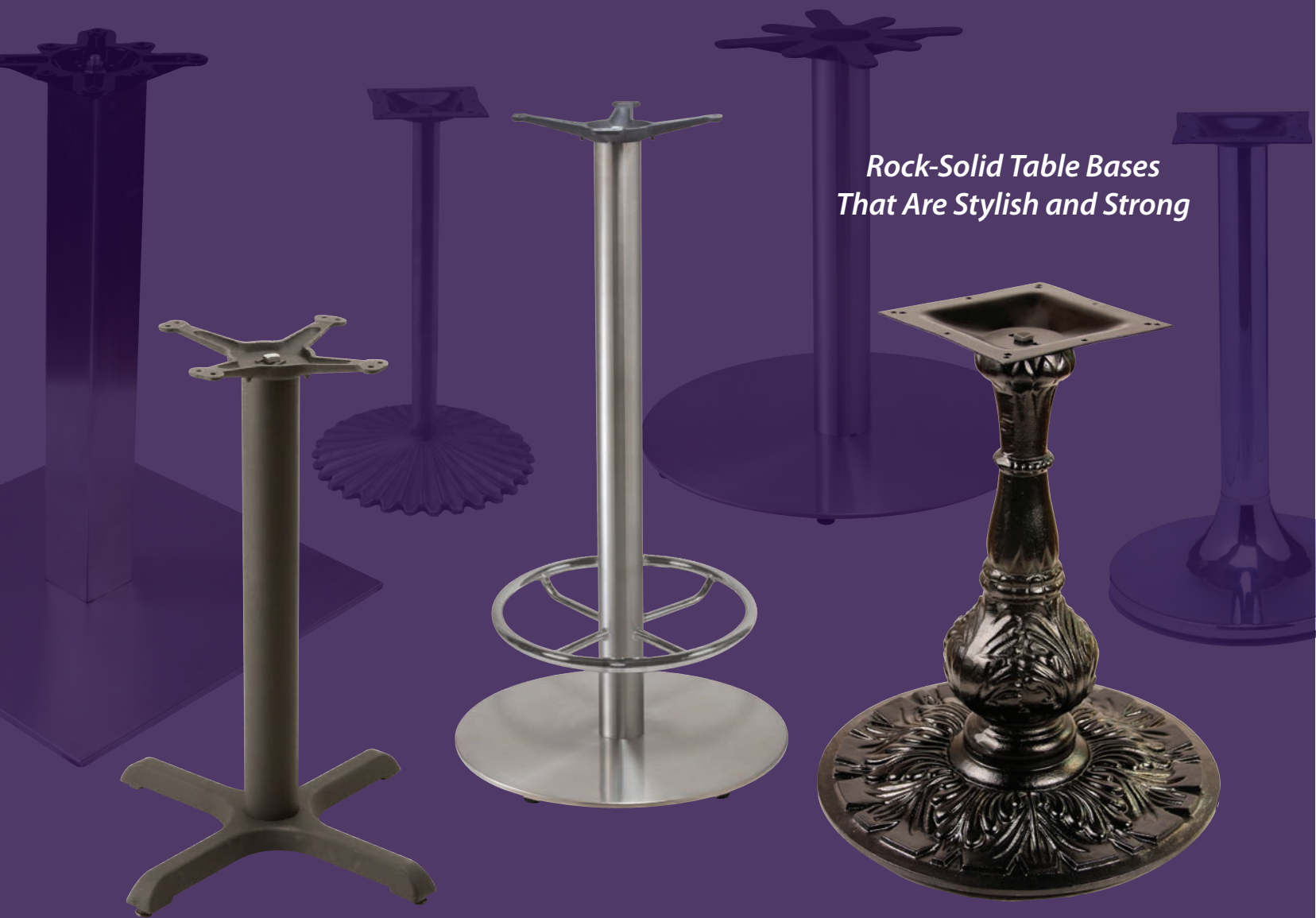
Table Bases and Base Options Classic or Ornate, We Have It All!

Rock-Solid Table Bases That Are Stylish and Strong