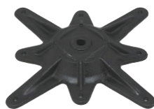
SS-15J 15 1/4" Cross