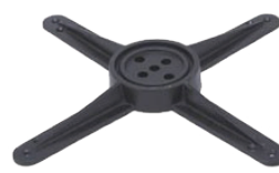
SS-19 19" Cross