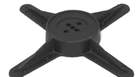
SS-21 21" Cross; fits 6" tube