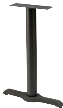
End Base (Used in pairs)