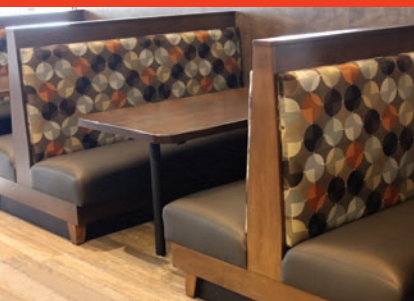
Booths, Banquettes, and Benches

Interested in more of Soft Touch Furniture's work? See our other catalogs.