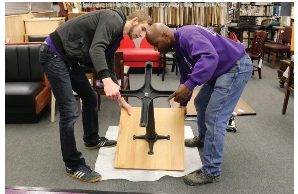
Table is fully assembled.